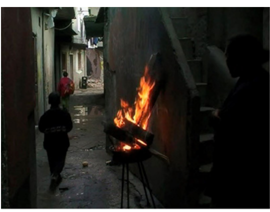
Figure 3 Photograms of No Quarto de Vanda (Pedro Costa 2000).