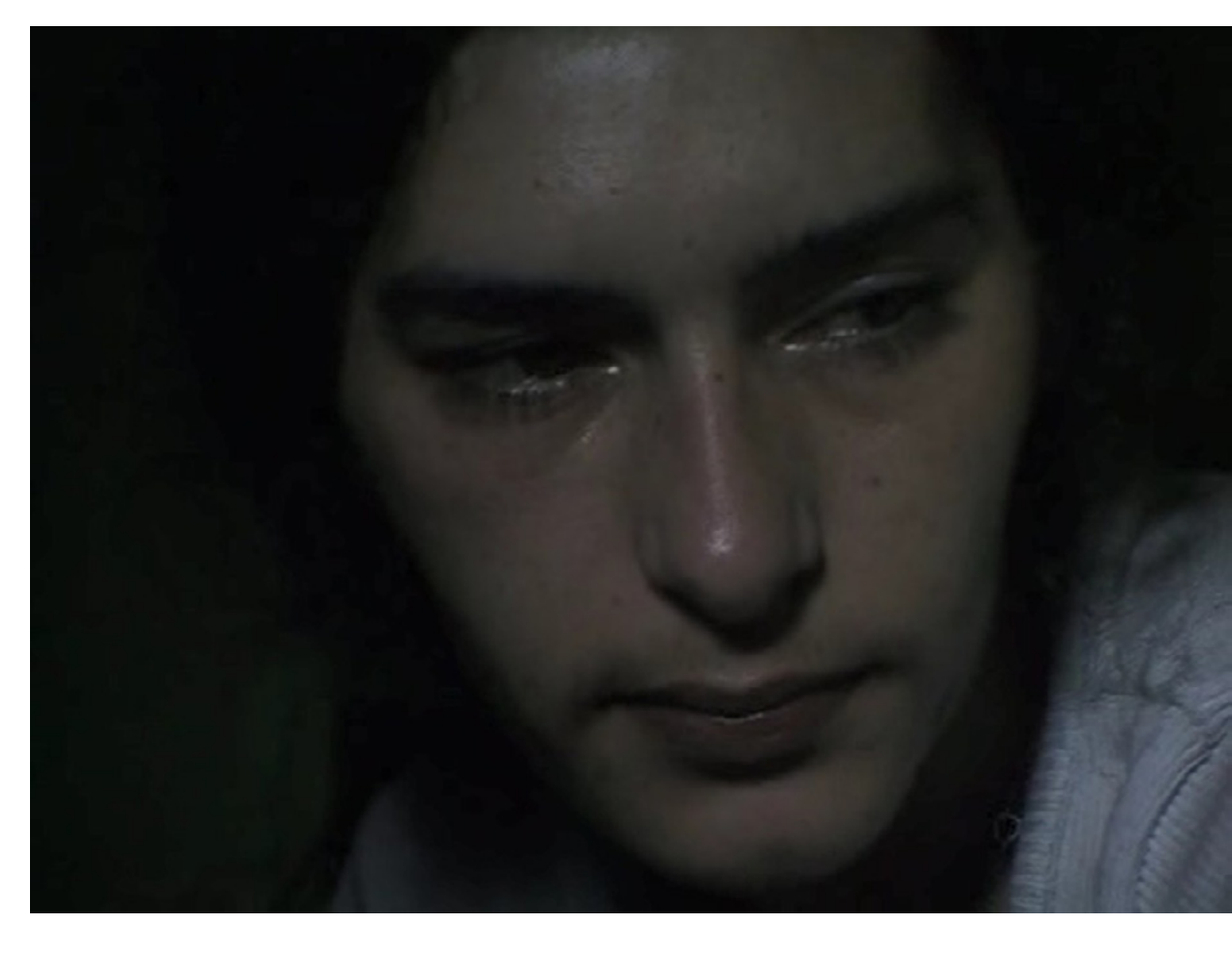
figure 4 Photogram of No Quarto de Vanda

So, at the origin of [No quarto de] Vanda, there was also this challenge: to face a real real , a truly documentary game. But it was necessary that this documentary invitation be fed by a fiction. A documentary that does not begin with a fiction of this genre does not exist. They invite me to some place, I like people, they like me: this is what makes a movie (Costa 2012, 47).