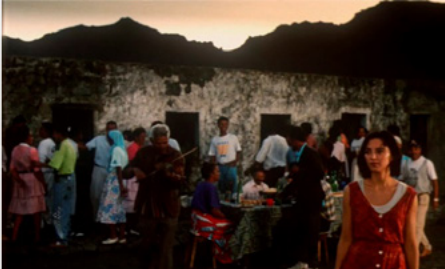
Mariana deixa-se afetar por Cabo Verde e seus habitantes