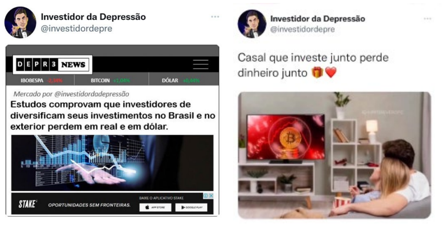
Figure 2 Examples of posts by Investidor da Depressão

Investidor da Depressão , on the other hand, has the following phrases in its profile description: "Investment Memes" and "Learn how to lose money before you win." The page is run by Rodrigo Castro and employs a humorous strategy that involves inverting some common places in the financial market - such as, for example, the project "From a Million to a Thousand" (referencing Thiago Nigro's best seller Do Mil ao Milhão - From a Thousand to a Million) - and the stories of failure in finances due to poor choice of financial assets.