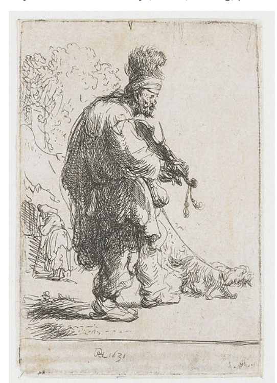
Figure 8: De blinde violist by Rembrandt H. van Rijn, 1631, etching, printed on paper, 78 x 53 mm.